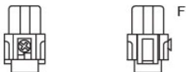
contacts side (front view)